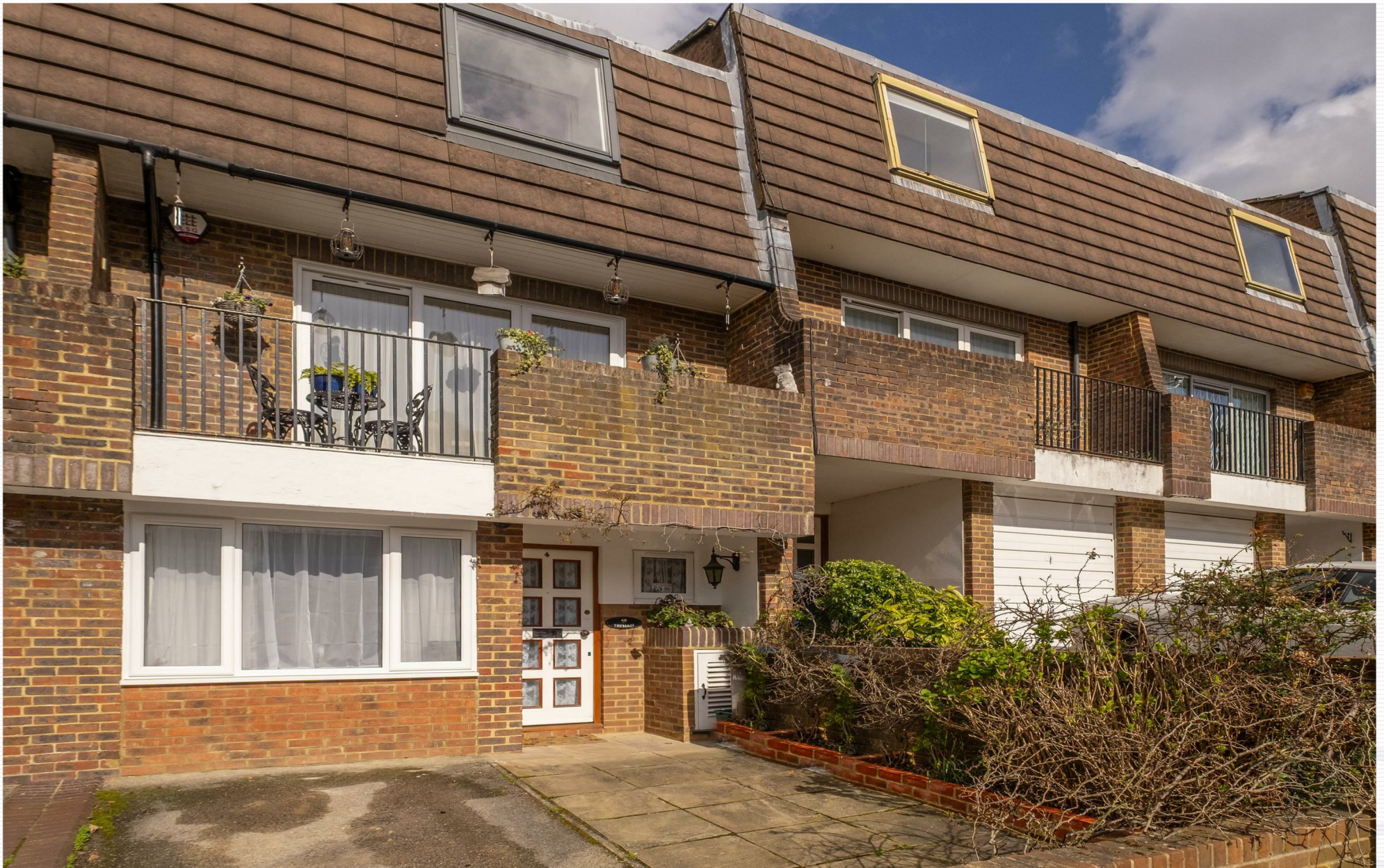
Heights Close, West Wimbledon, SW20 0TH